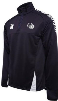
1/4 Zip Training Top