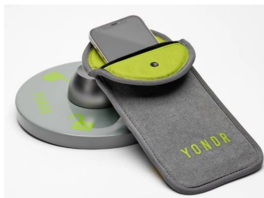
Image of an example phone pouch and the magnetic locking system

This will allow us to have a more purposeful start and a more effective end of the day. Instead of handing phones in to their Personal Tutors, each student will have a lockable pouch that will be checked in the morning and can then only be unlocked at the end of the day. This will avoid students having their phones out in the building.